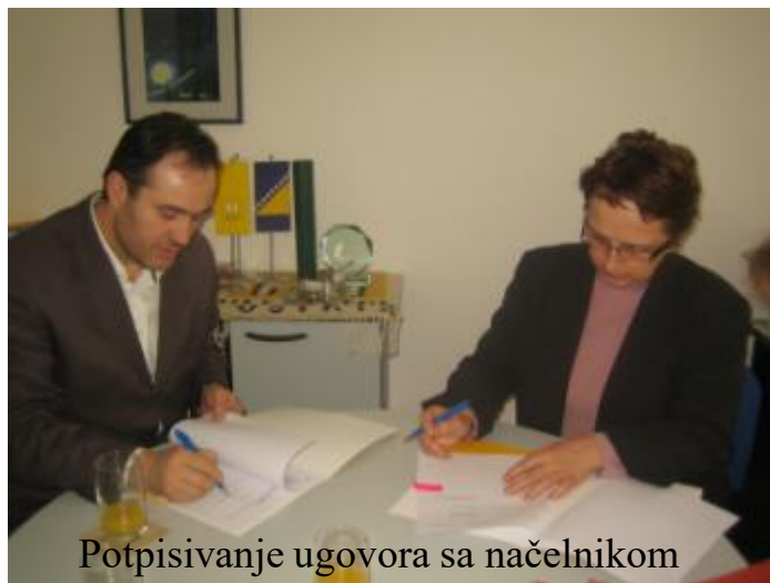
Potpisivanje ugovora sa načelnikom