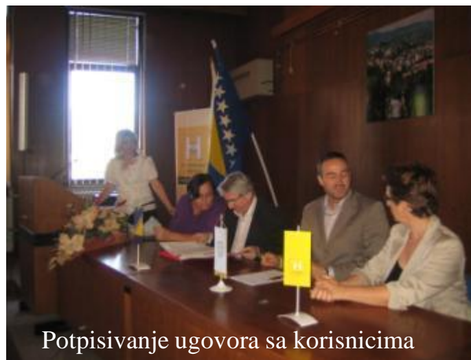
Potpisivanje ugovora sa korisnicima