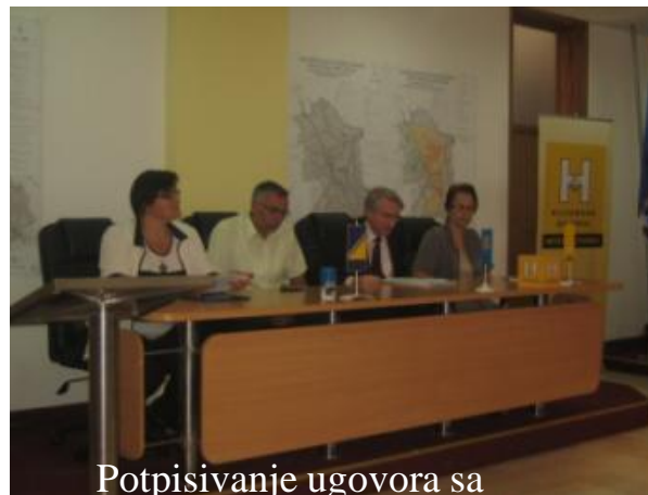
Potpisivanje ugovora sa